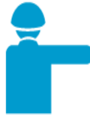
Right Turn (Alternate)

Printed copies should be used with caution. The user of this document must ensure the current approved version of the document is being used.